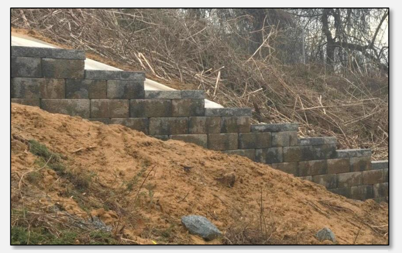
The new retaining wall near 3116 Lawrin Court will help stop erosion.

Official Newsletter of the Chesapeake Village Homeowners Association