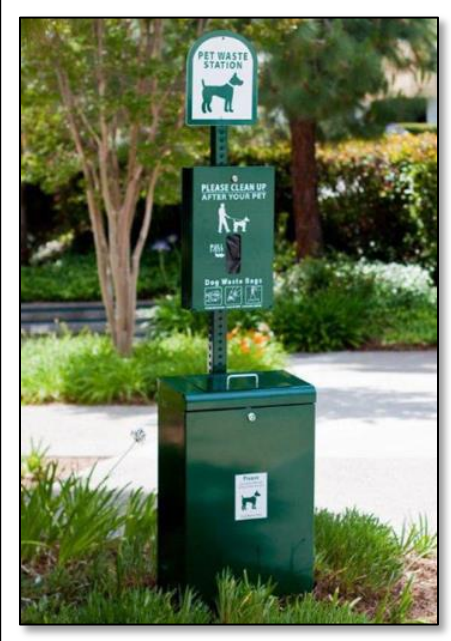
The pet waste stations will get weekly maintenance.

The rip rap near 3122 Lawrin Court has been slowly washing away, and Greener Visions is contracted to repair the drainage area. However, the contractor needs drier weather to be able use his heavy machinery.