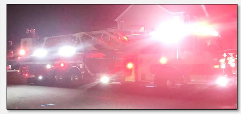
Santa waves from the back of a North Beach ladder fire truck as it turns from Lawrin Court to Hill Gail Drive.

Santa made a couple laps around the neighborhood on a large ladder fire truck. The HOA apologizes to families who didn't get the word that the fire trucks were not going to go down to the cul-de-sacs because of the tight turnarounds.