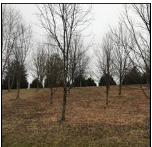
The entrance hillside pictured in June 2018 (top) and March 2019.