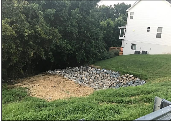
Rip rap repair on Cavalcade Drive.

Greener Visions has performed some contract work by cleaning up brush, vines, and branches in common areas along some of the roads. The HOA Board has been in contact with the contractor about some common areas that appears to be missing regular maintenance.