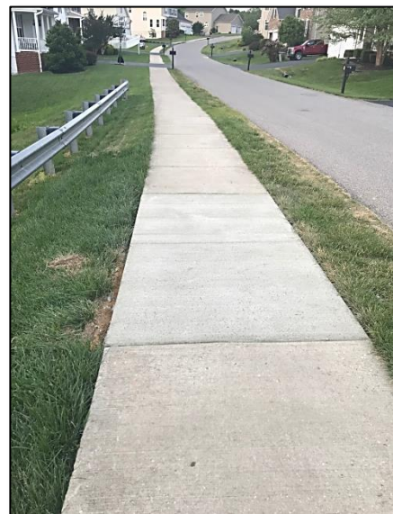
Sidewalk repair done by the Town of Chesapeake Beach on Middle Ground Court.

Heavy rains over the past few years have washed out a couple of rip rap areas in the neighborhood. One on Lawrin Court was repaired last year, and one area on Cavalcade Drive was repaired recently by Greener Visions. The contractor also reseeded the grassy area.