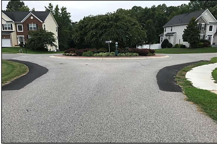
Traffic circle gets asphalt repairs.

Official Newsletter of the Chesapeake Village Homeowners Association