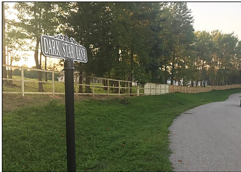
A fence under construction runs near the property line between North Calvert Woods properties and Dark Star Lane.

Entering private property without permission could be seen as trespassing.