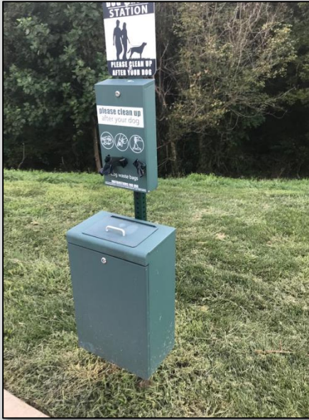
The pet waste station along the west side of Lawrin Court.