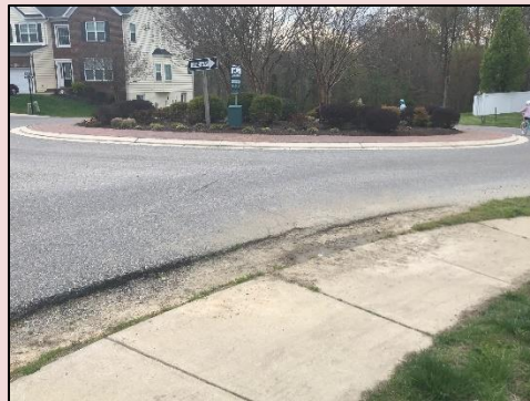
Large trucks have been creating ruts between the asphalt and sidewalk around the traffic circle.