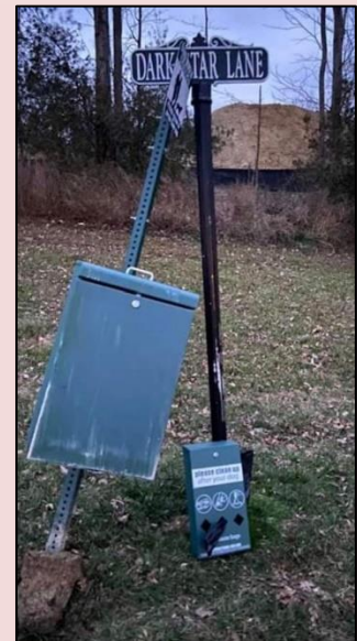
This pet waste station has seen better days, but it is now operational once again.