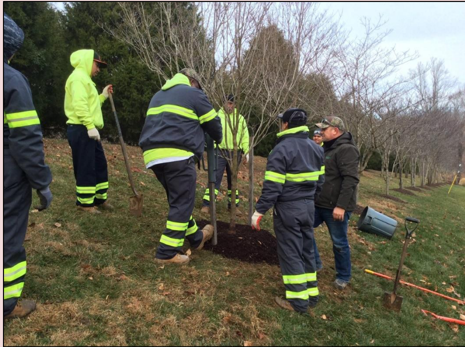
Greener Visions workers plant a tree near the village entrance along Bayside Road, using the opportunity as a training session for employees.

In other news, the Town of Chesapeake Beach is planning to pave some of the barren areas near the traffic circle. Large trucks cut the corner too sharp and have been creating ruts and killing the grass. Growing grass there has been futile, so the town has decided to extend asphalt to the sidewalk.