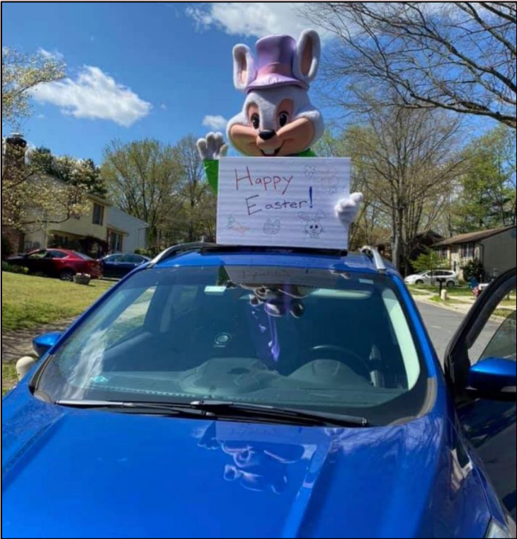
The Easter Bunny gets a ride in the neighborhood on April 11.

Official Newsletter of the Chesapeake Village Homeowners Association